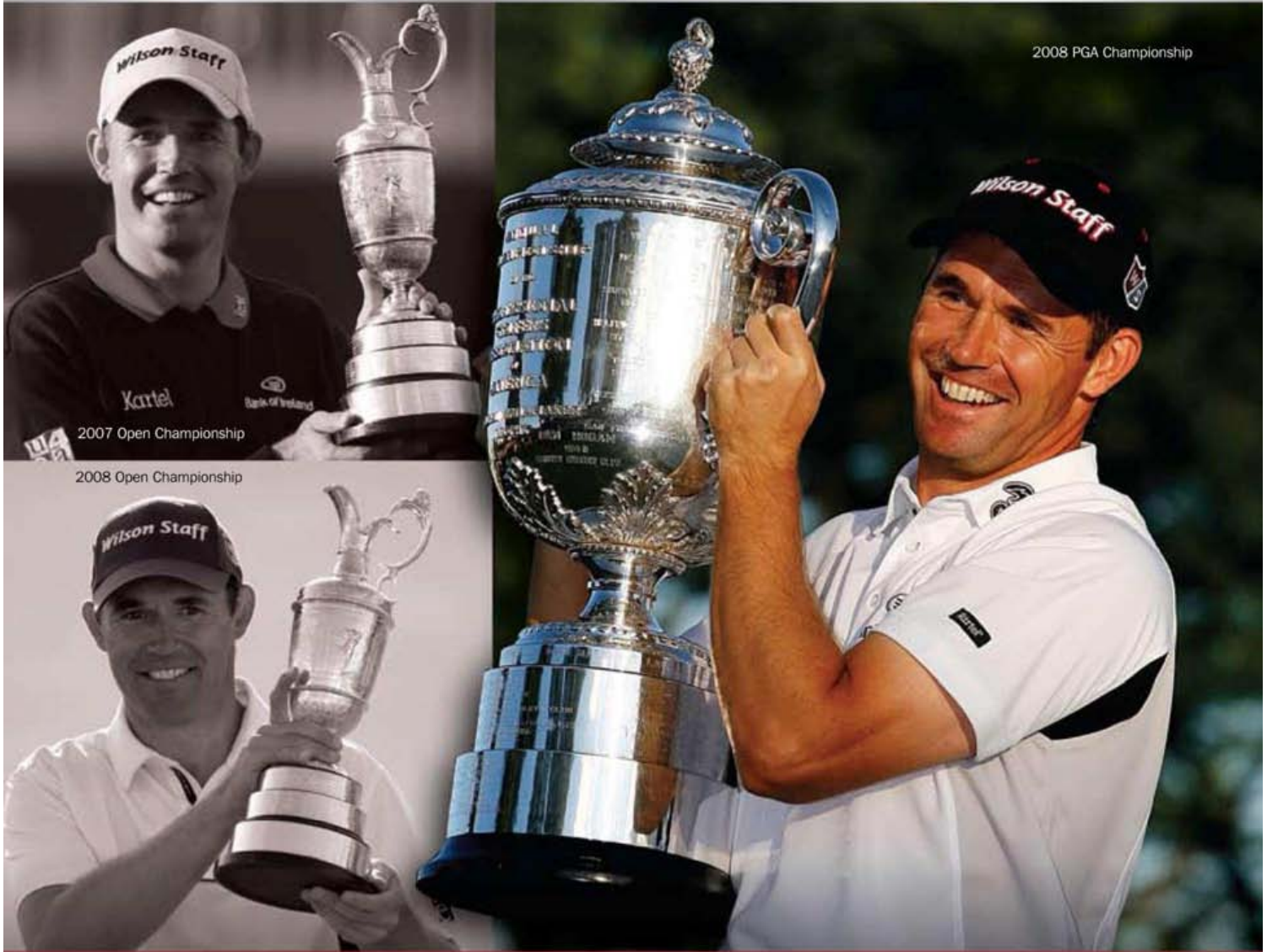
2008 PGA Championship