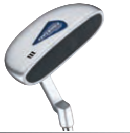
Prostaff Putter III