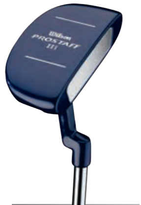
Mallet Putter with Weight Screw