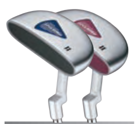
Prostaff Putter II