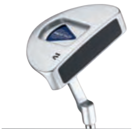
Prostaff Putter IV