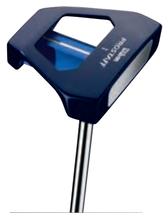
Triangle Bar Putter

Anodized aluminum alignment bar combined with a milled face delivers great feel and pinpoint accuracy.