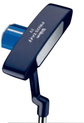
Heel Toe Putter with Weight Screw